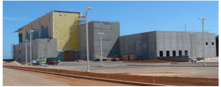
Honolulu Advertiser Production & Distribution Facility with Dick Pacific Construction.

begin soon, opportunities will be abundant for a prosperous construction industry. We will be in a good position to handle this new workload with the Demming tools and training in the OSHA 30-Hour Construction Safety & Health Course.