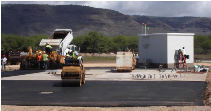
Launch Facilities at PMRF project with TOMCO Corp.

Projects completed this past quarter include Kuhio Highway Resurfacing – Hardy to Kuene Road (Glover) and Launch Facilities @ PMRF (TOMCO Corp). Ongoing projects include Marriott's Waiohai Beach Club (Unlimited/Maryl JV), Kapa'a Homesteads Well No. 2