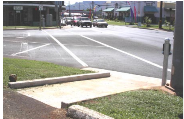
Kuhio Highway Resurfacing Hardy St. to Kuene St. with Jas. W. Glover