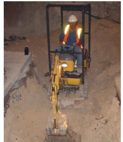
Hale Koa Hotel Pantry Renovation with Kiewit Pacific

As we approach the Holiday season, be safe and God bless.