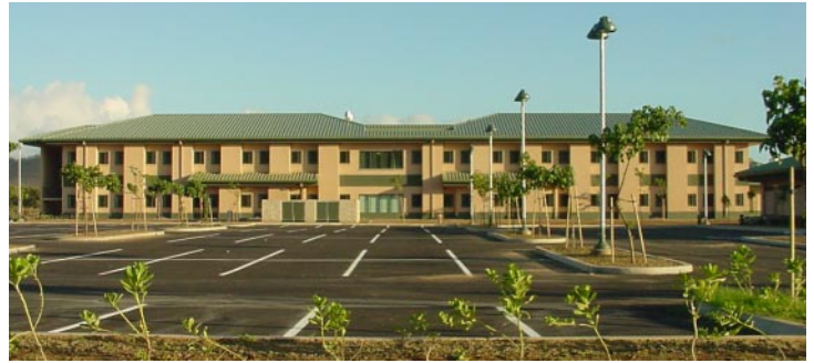
Regional Training Facility at Bellows with Ocean House Builders.

This past quarter Koga's Oahu operations were able to complete several projects which included Rehabilitation of Streets Unit 11B (City & County of Honolulu), Department of Agriculture Annex 3 (Nordic Construction), 298th Regional Training Institute @ Bellows (Ocean House Builders) and Abrasive Blast/Paint Facility @ Pearl Harbor (Bodell Construction). Ongoing projects include Marriott's Ko' Olina Timeshare (Dick Pacific), Kai Lani Subdivision @ Ko' Olina (Armstrong Builders), and Pacific Command Center at Camp Smith (Dick Pacific) Jobs anxiously awaiting start dates are Mokaua Street Improvements (City & County of Honolulu), Hale Koa Hotel Laundry Renovation (Kiewit Pacific), and Traffic Calming Improvements Pearl City (CCH-DTS).