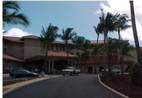
Marriott Waiohai project with Unlimited Construction/Maryl JV.