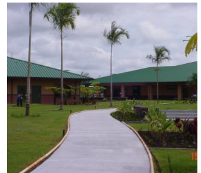
Kamehameha School Phase 2 project with Hawaiian Dredging.