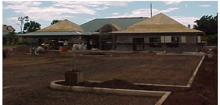
Waimea Tech Center with Unlimited Construction.