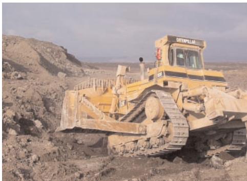
Brian "Bully" rippin Clubhouse Loop Road.