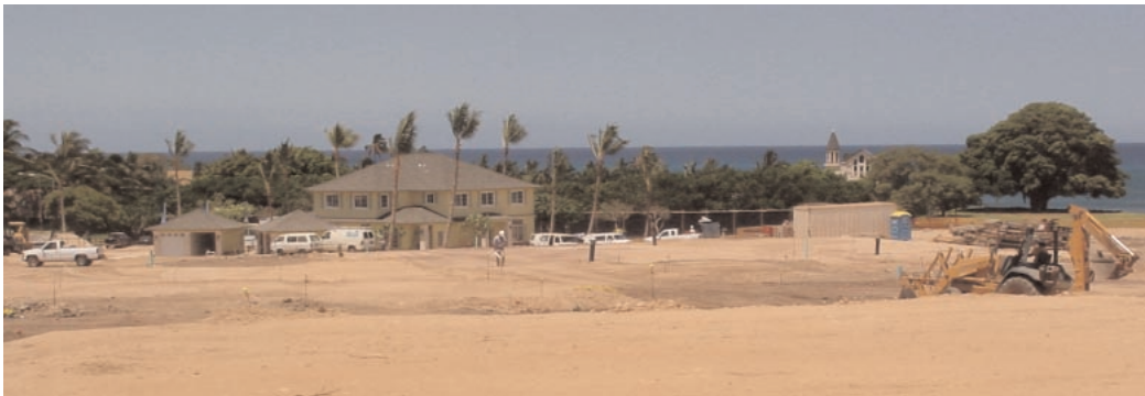
Kai Lani subdivision for Armstrong Builders.

Until next time... "Commit to Excellence" and "Just Win Baby!"