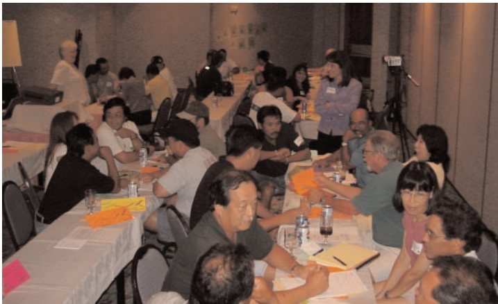
Management, Foreman and Staff retreat held recently at the Waikiki Marriott.

On the weekend of April 20th, our Foreman and Office staff attend a seminar at the Waikiki Marriott. The Koga retreat was a fun learning experience. Team building skills and negotiating techniques, which could easily be applied at work as well as at home, were the focus of the retreat. I tried teaching my kids one technique in which you substitute "and" for "but". For example, you did a good job on your chores