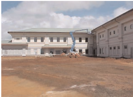
Kauai Police Station with Shioi Construction.