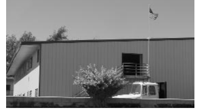
The American Flag flies over Koga's new office building.

being sold out of American Flags and some instances of price gouging.