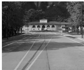
Kealahala Road Extension at Windward Community College.

(the crew was equipped to work in Hilo). Just as signs of moss growth began to appear, the rain stopped and all was back to normal. The D.A.G.S. concrete road construction commenced at this point with installation of the drain system, curb and gutters, and roadway grading. Elevations and alignment were checked, double checked, and finally the concrete roadway was poured. This team visualized the process and the finished roadway before the concrete pour, and that was how it turned out after all was completed. The same process eventually set the pace for the sidewalks and remaining curb and gutters, with "continuous improvement". High five's for everyone's "teamwork" on this project's accomplishment and taking pride in their work.