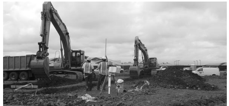
Kamehameha Schools East Hawaii Campus Phase II