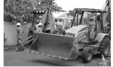
Lawai Road Water Line.