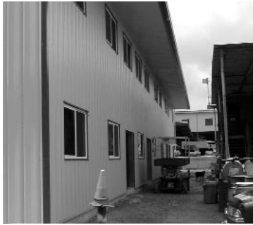
New Koga Office Building

As we all know, Koga personnel are always looking for a snack to eat. Well, at the main office, if you haven't already noticed we started our own vending machine. We only charge what we paid and we'd like to pass on the savings to you. So please check it out. If there is a particular snack that you would like sold, please leave a note in the cash collection tin.