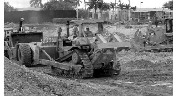
Marriott Ko Olina Mass Grading with Dick Pacific

deal only to find out we bought an inferior product. In the past the construction industry has been based on the "low number" or "cheap price" method of award. Sometimes things go smoothly. Other times the owner may not get what they expected. Recently though, things have been changing. Of course price will always be an issue but more and more we are seeing owners and government agencies move toward "best value" method of award. It could be a Design Build Project, a PIPS project, a Short List of bidders or a Request For Proposal. In these situations, past performance, "Quality" of workmanship, reputation and willingness to work as a team are major factors of award.